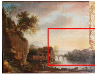
Figure 1: A visible spectrum image of the full oil painting, with a red marker indicating the region of interest.